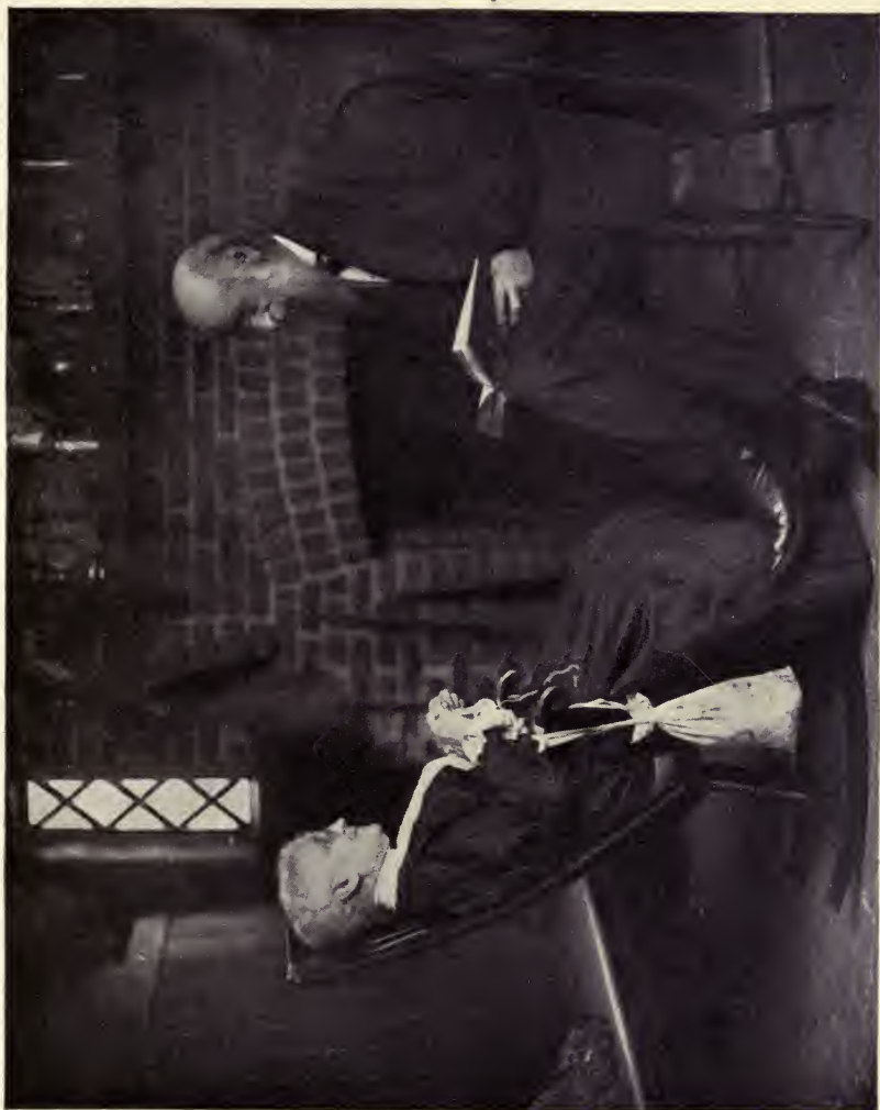
DR. AND MRS. LYMAN ABBOTT AT THEIR FIRESIDE